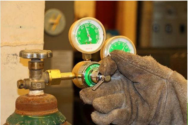
Roane Jackson Technical Center

Development of countywide roundtable of major employers and training providers.